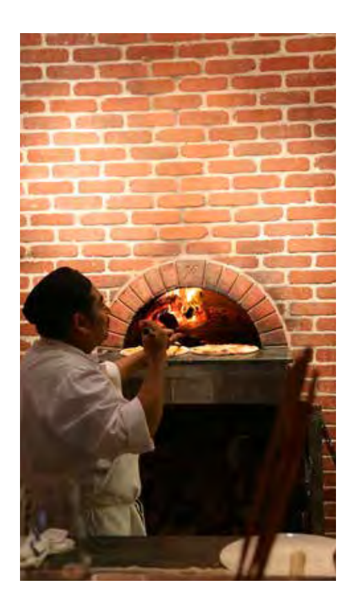
A Wood fire pizza oven is the heart of Cantinetta Luca in Carmel-by-the-Sea.

More lovely touches include apples and cookies at the front desk, coffee, tea and sparkling water in your room, night-time chocolate on your pillows, wine tasting at 5:30 p.m. and fresh baked cookies and milk later in the evening. Brush up on your chess skills with the life size chess set on the patio.